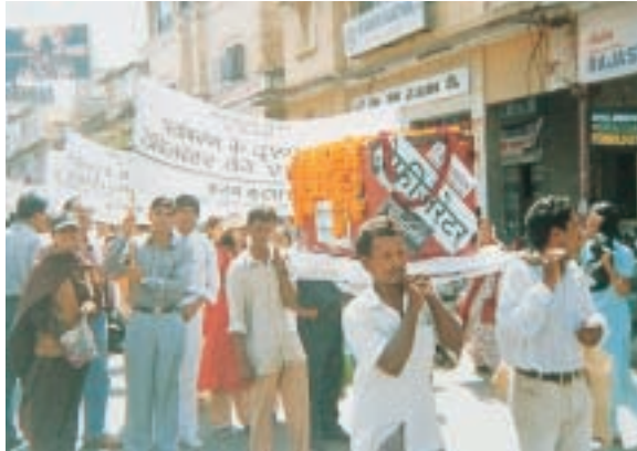
Demonstrators in India hold a “refrigerator funeral” to accelerate the phase out of refrigerators that use CFCs.

The 1987 Montreal Protocol commits its 175 signatory countries to eliminate the use of ozone-depleting substances. Industrialised countries promised to phase out the use of these substances at various times throughout the mid 1990s. The target for developing countries is 2010.