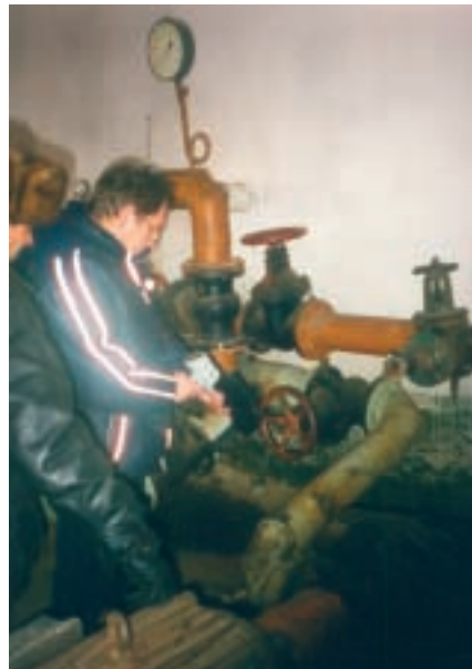
Energy audit of a district-heating system

The project promised environmental benefits for Sweden and the Baltic countries. About 90% of energy systems in the Baltic countries are fossil-fuel based, particularly district heating systems. These heating systems are relatively well developed, but often in poor condition due to lack of maintenance. Many