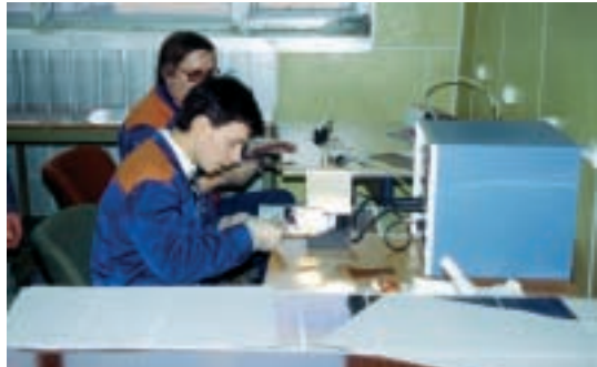
Programme staff analysing data from energy-efficiency audits