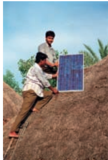
Installing solar panels as part of a new service module

During the 1990s, new tax policies and changes in power regulations improved the investment climate for renewable-energy technologies in India. At the same time, the Indian government, the World Bank and the Global Environmental Facility (GEF) supported a renewable-energy development project to improve the functioning of commercial markets for wind, mini-hydro and solar PV technologies. 30 The project, along with assistance from Denmark and other sources helped the India Renewable Energy Development Agency (IREDA) to promote and finance private investment in renewable energy. IREDA now conducts marketing campaigns, offers business training, provides various types of credit and subsidies and offers other financial incentives.