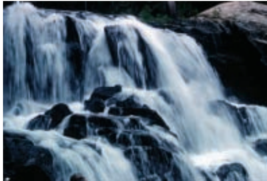
Small waterfall in the Philippines.