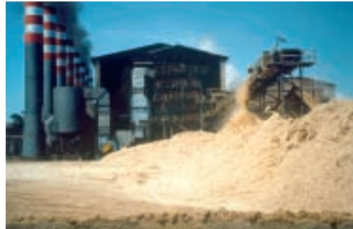
Biomass co-generation power station