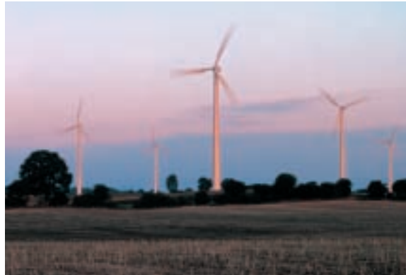
Enron “Wild” 1.5 MW wind-turbine